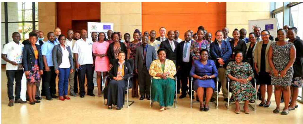
Minister for General Duties Justine Kasule Lumumba, Minister of State for Northern Uganda Affairs Grace Freedom Kwiwucwiny, Minister of State for Karamoja Affairs Agnes Nandutu and Head of Sustainable Development at EUD Nadia Cannata in a group photo with DINU implementing partners shortly after the coordination meeting in Kampala on October 28, 2022.