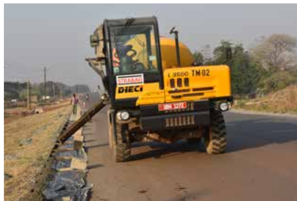
RIGHT: Construction works in progress at Atiak-Laropi road