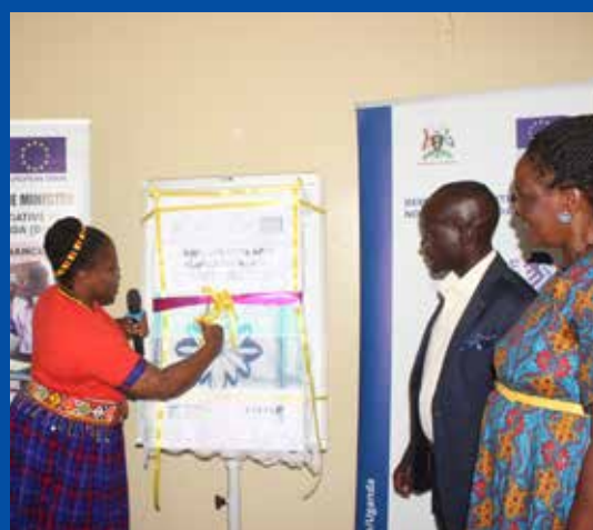
The Minister of State for Karamoja Affairs, Hon. Agnes Nandutu, launches a handbook aimed at promoting good governance and accountability for District Local Governments in Northern Uganda in Moroto on December 2, 2022.