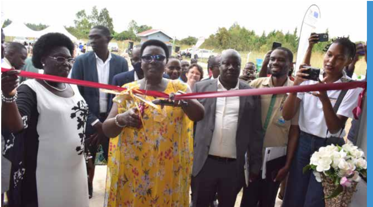
Minister of State for Northern Uganda Rehabilitation Grace Freedom Kwiycwiny flanked by Ms. Betty Ochan, the Gulu City Woman MP, commissions the agro-investment hub in Gulu on November 23, 2022.