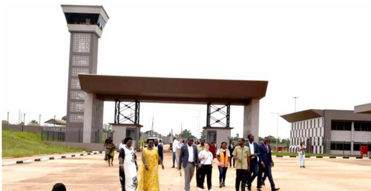
The Minister of State for Northern Uganda Rehabilitation, Hon. Grace Freedom Kwiycwiny, flanked by Ms. Betty Aol Ochan (left), the Gulu City Woman Member of Parliament, representatives from OPM, EUD, Ministry of Finance, Uganda Railways Cooperation and Gulu District leaders, tours the Gulu Logistics Hub on November 23, 2022. Construction works of the facility are complete.