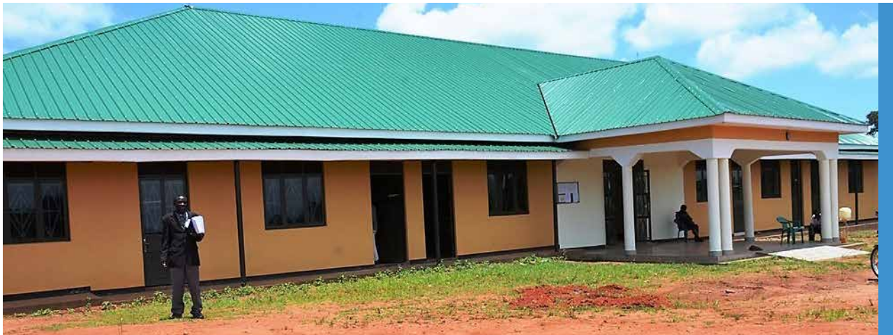
The new administration block of Zombo Town Council.