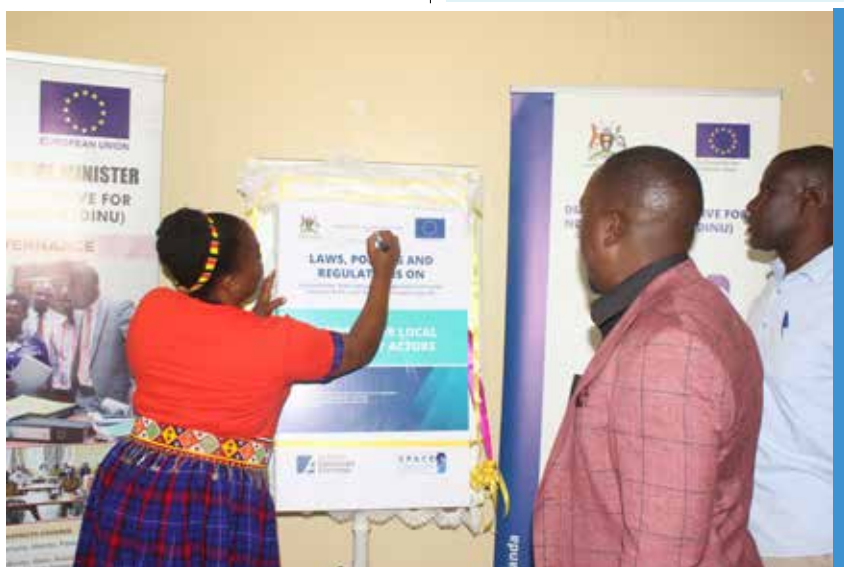
Minister autographs a dummy copy of the handbook shortly after the launch on December 2, 2022.

The KAS team said: “It is our hope that, through this resource of legal references, we shall further strengthen and improve the efficiency and effectiveness of the governance of local government councils at both the higher and lower levels.”