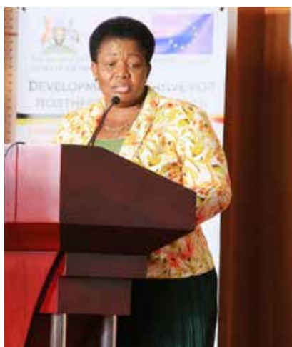
Minister for General Duties Justine Kasule Lumumba

The Minister was on October 28, 2022 presiding over the DINU coordination meeting between Ministers from Office of the Prime Minister and the programme implementing partners (IPs) at Office of the President Conference Hall in Kampala.