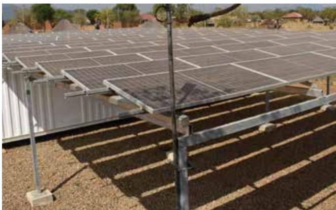
LEFT: More than 14 mini-grids have been installed in Lamwo District