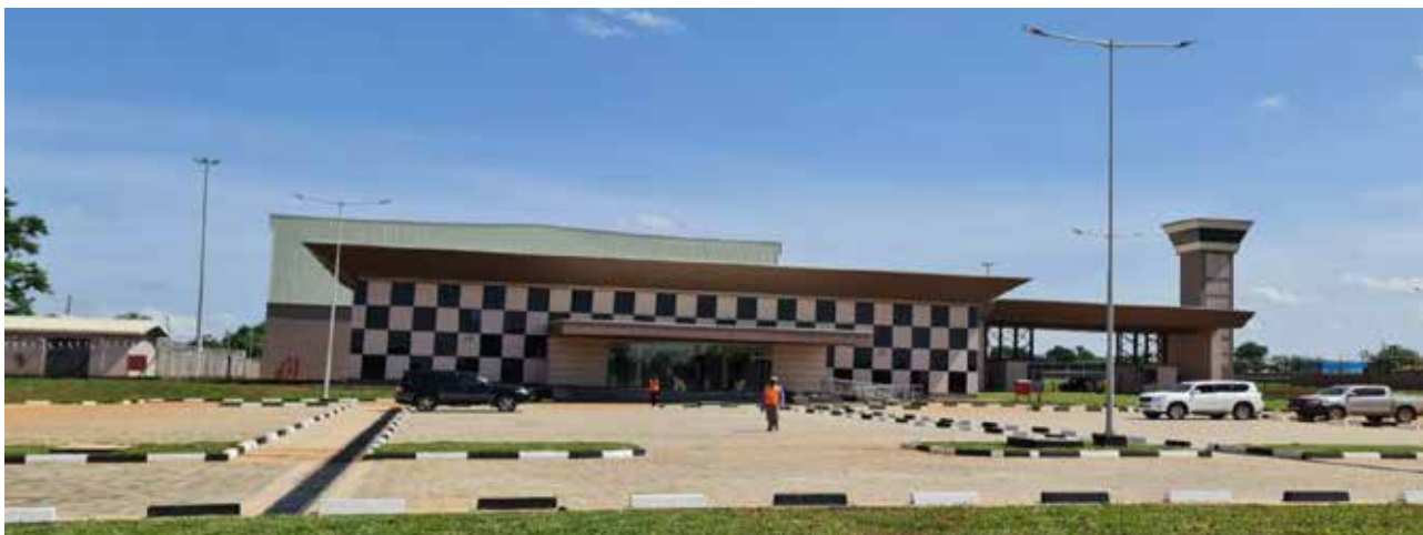
Administration building of the Gulu Logistics Hub

This newsletter is a major step towards joining the various pieces of the puzzle that is the DINU programme and will contribute towards joint communication and visibility of the programme. The newsletter will contribute towards showcasing the achievements of all partners implementing various actions across Northern Uganda also known as “connecting the dots.”