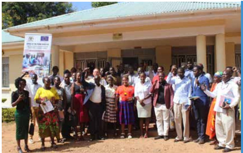
Moroto District leaders and OPM officials join the State Minister for Karamoja Affairs in a group photo after the launch.

“I thank KAS and partners under this DINU grant for working closely with the DLGs to improve accountability and responsive service delivery. We