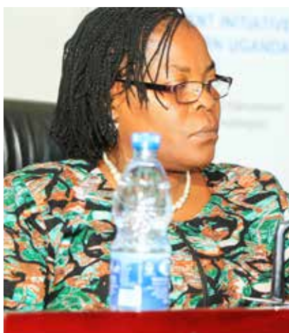
Minister Agnes Nandutu attends the meeting

DINU, an affirmative action programme of the Government of Uganda supported by the European Union and supervised by Office of the Prime Minister (OPM), is implemented in 41 districts in the five sub-regions of Acholi, Lango, Karamoja, Teso and West Nile. The DINU overall goal is to: Consolidate stability in Northern Uganda, eradicate poverty and under-nutrition and strengthen the foundations for sustainable and inclusive socio-economic development.