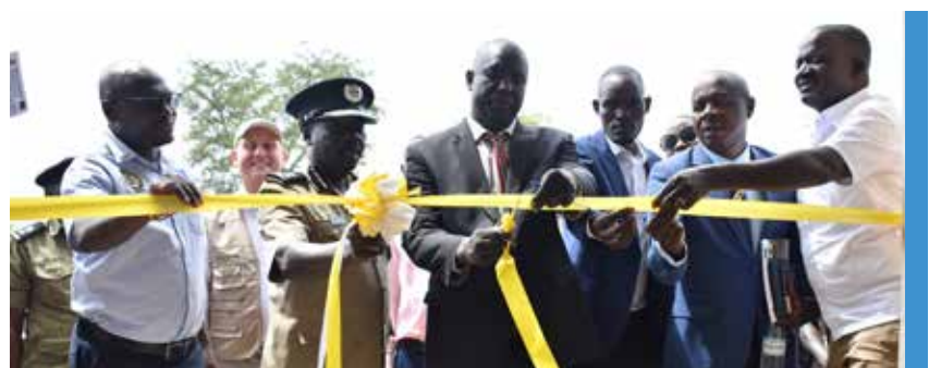
Commissioning of Morulem Community Police Post