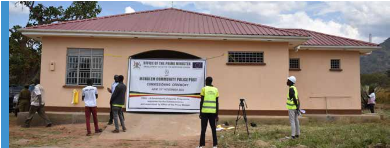
COMMISSIONED: Morulem Community Police Post.