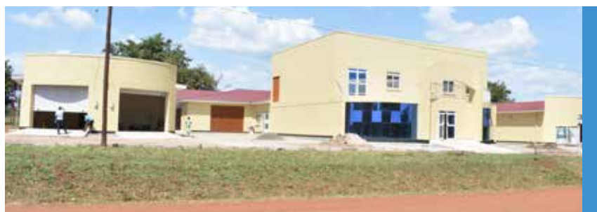
The Otukey Business and Governance Centre has been established to boost local revenue.

The minister toured various DINU projects in Gulu, Lira and Otukey districts from 23-25 November, 2022. In Gulu, she visited the Gulu Logistics Hub and also commissioned