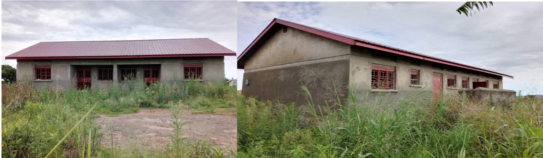
Above: A staff house being constructed at Atyak Health Centre III to ease absentism and late coming of Health Workers