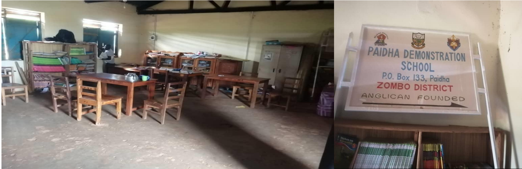
A classroom that was taken over by staff to act as Office and staffroom at Paidha Demostration School forcing children to study under a tree, a mater raised during Baraza