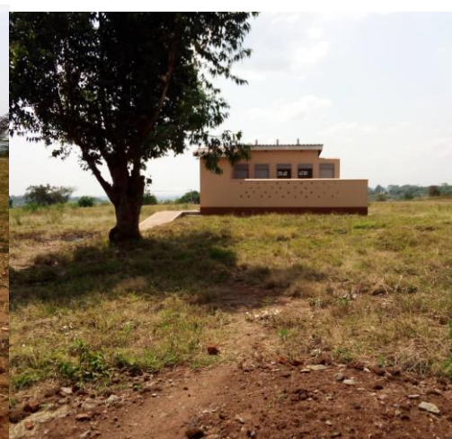
Above are the staff houses, latrine stances constructed at Atyak seed school and a football field all done under UGIFT