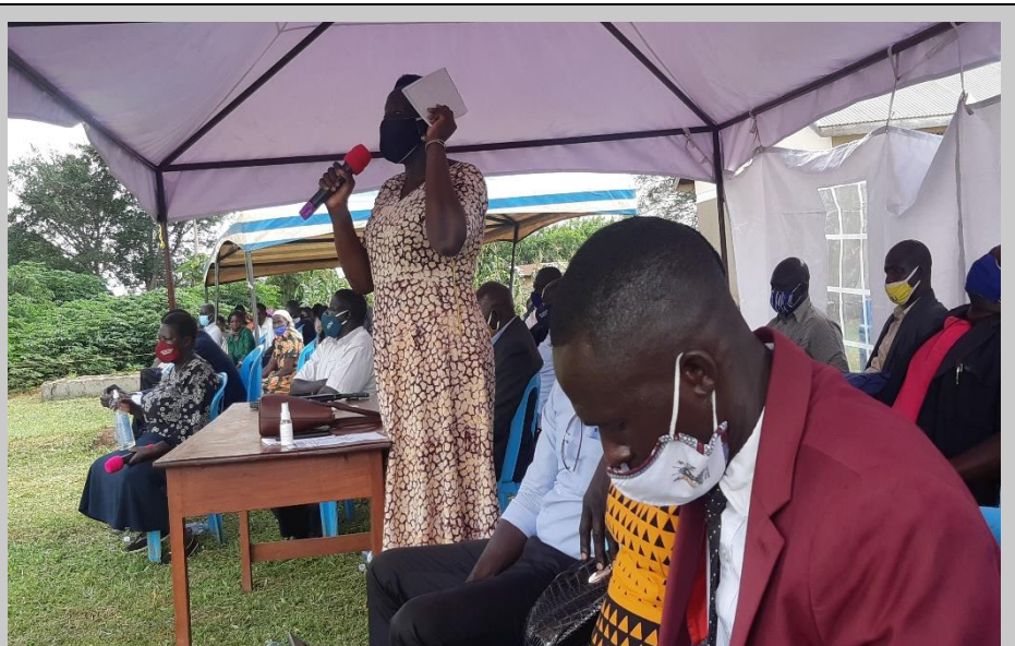
The RDC of Oyam District chairs the Baraza in Aber Sub County jn November 2020: RDCs were very instrumental in laying down the agenda during Barazas in the Districts.