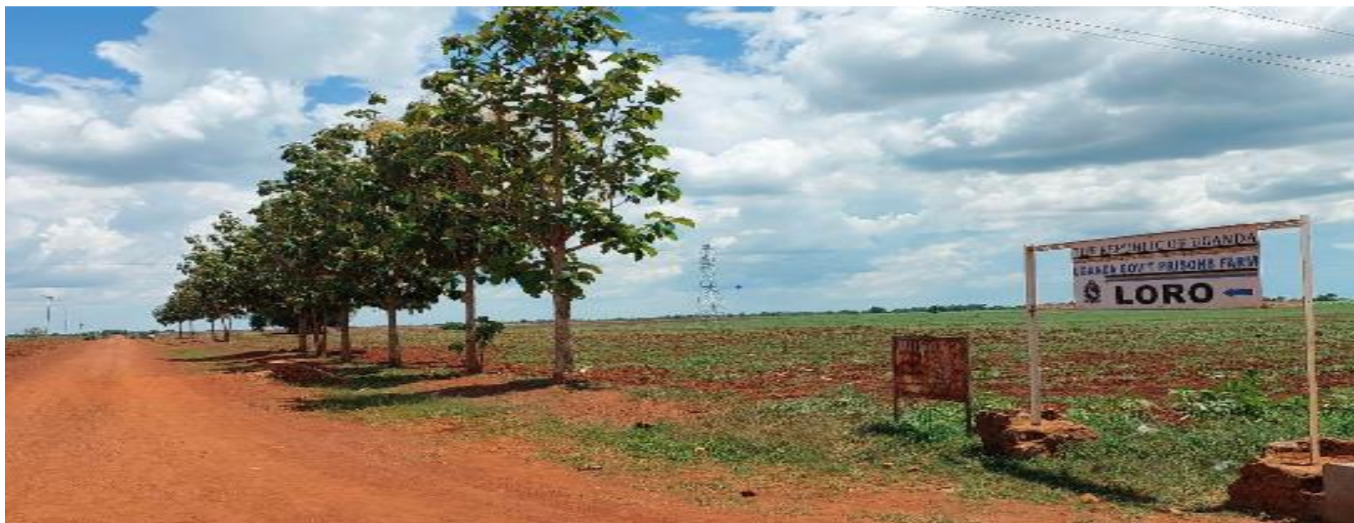
Loro-Prison Farmland road 12 th April 2023

During the recent spot-monitoring and follow exercise, it was found that the road has been rehabilitated by Government and currently looks as in the picture below: