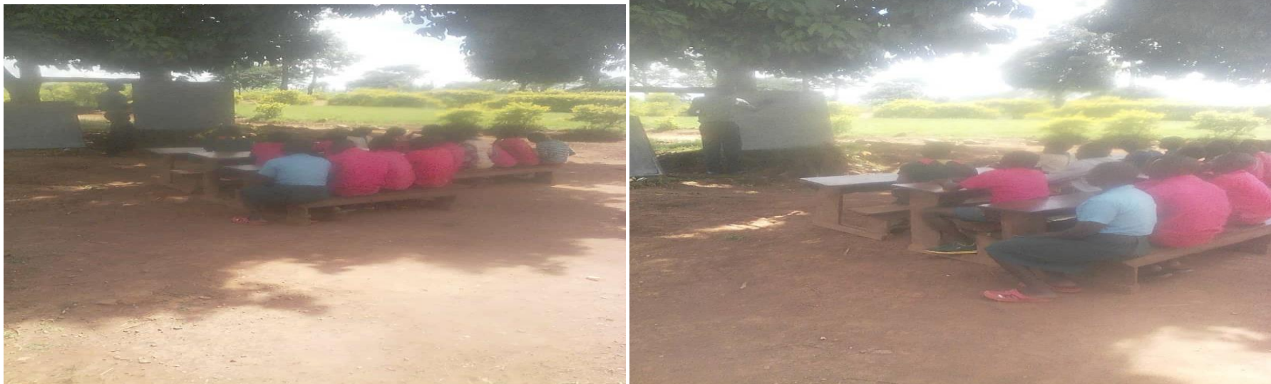
Students of P6 learning under a tree at Odarlembe Primary School in Abanga Sub County, Zombo district, the district can not construct more classroom due to declining SFG