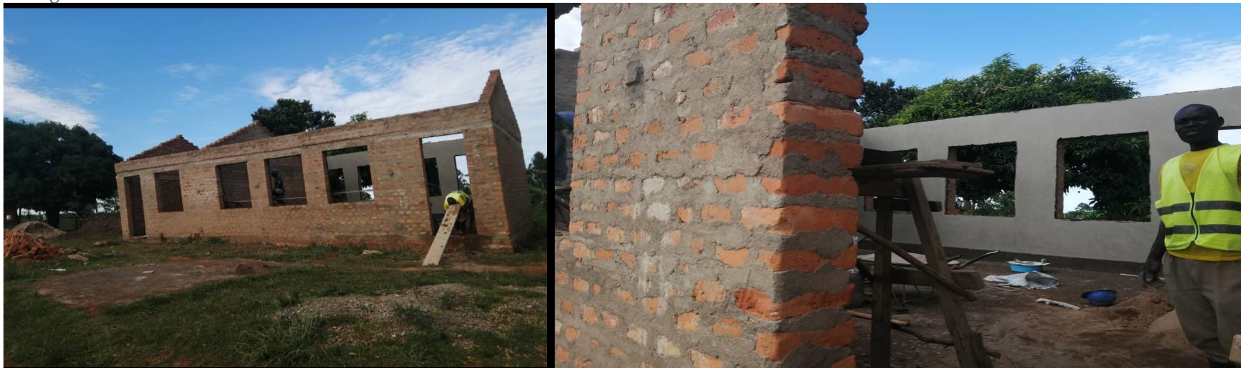
Above: A new structure being built to house the Staff room, Office and store as a result of the Baraza held at Paidha TC where the matter was raised