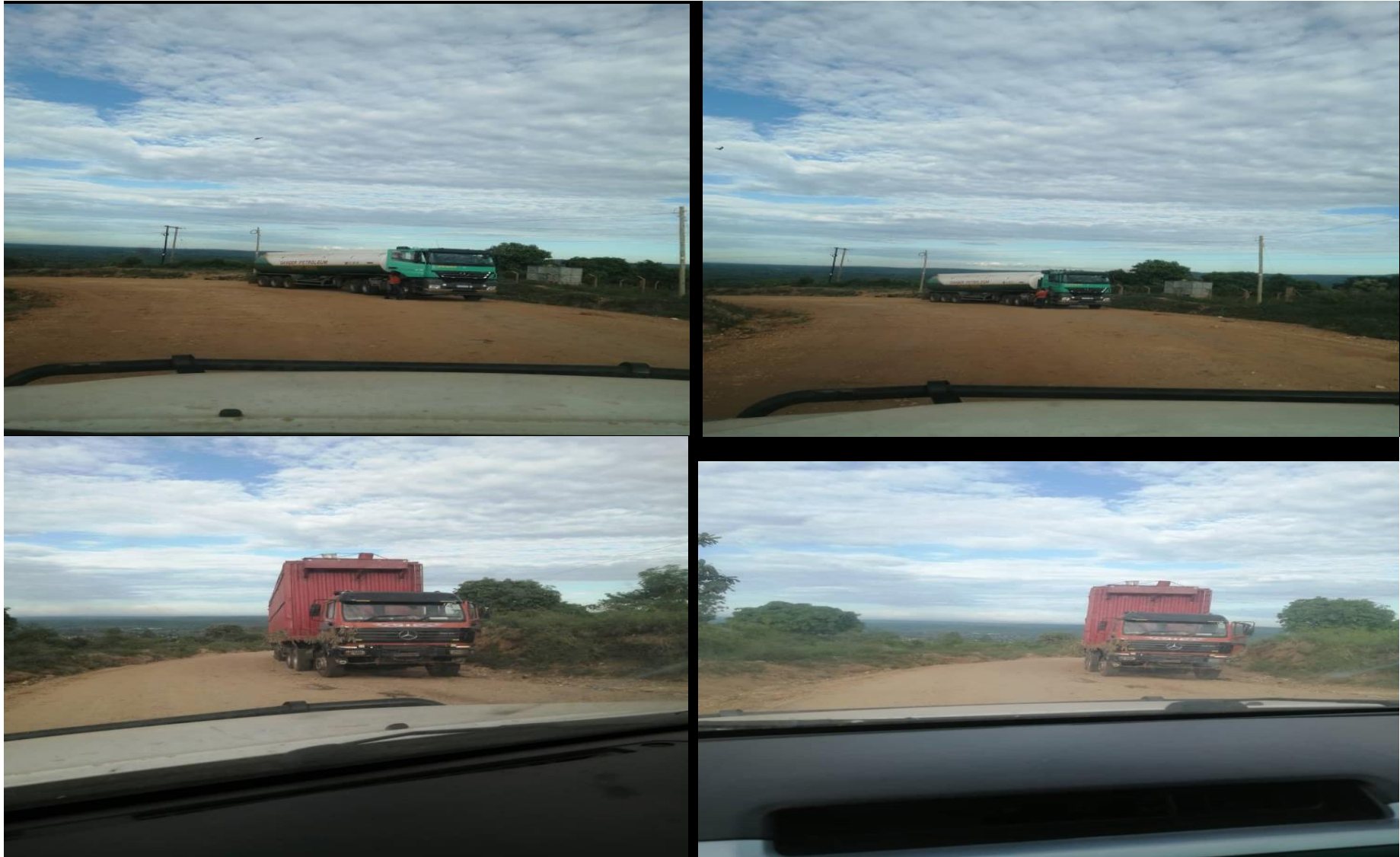
Different sections of Nebbi-Paidha--Goli-Vurra which is dusty and falls under the presidential pledges for tarmacking, in the section above, the truck failed to climb the hill