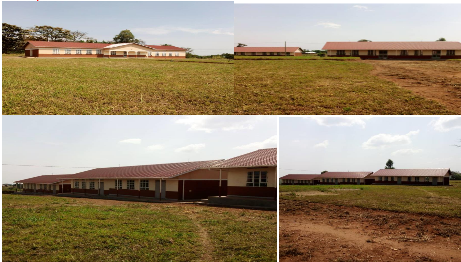
Atyak seed school newly constructed in Atyak Sub county Zombo District which has attracted over 600 students in just the first term of the year