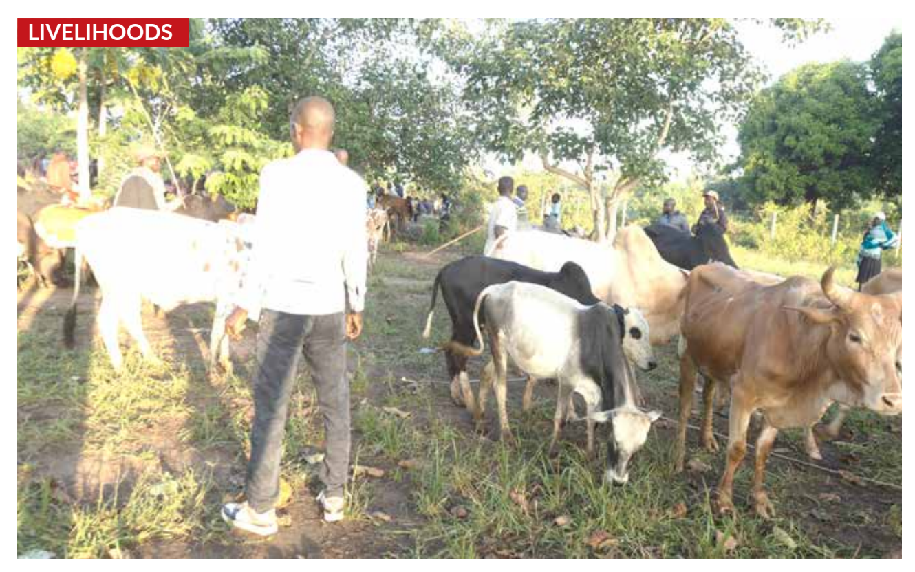
The establishment of Wera Livestock Market has resulted into improved local revenue and better animal disease control in Wera Town Council.