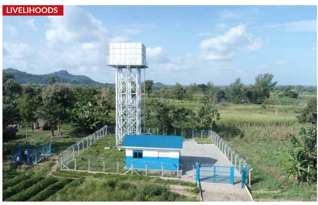
With the establishment of Adibo Water Scheme, communities no longer worry about water scarcity in Yumbe.