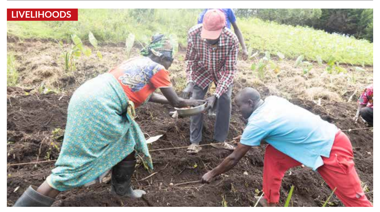
Farmers in Zombo now plant in rows for increased production following the DINU training.