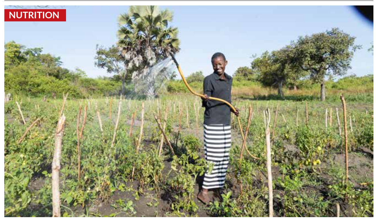
The supply of water by DINU programme has helped mothers as well as the community to grow vegetables all year round. The farmers eat vegetables for their nutrition and sell the surplus to earn money for buying other necessities.