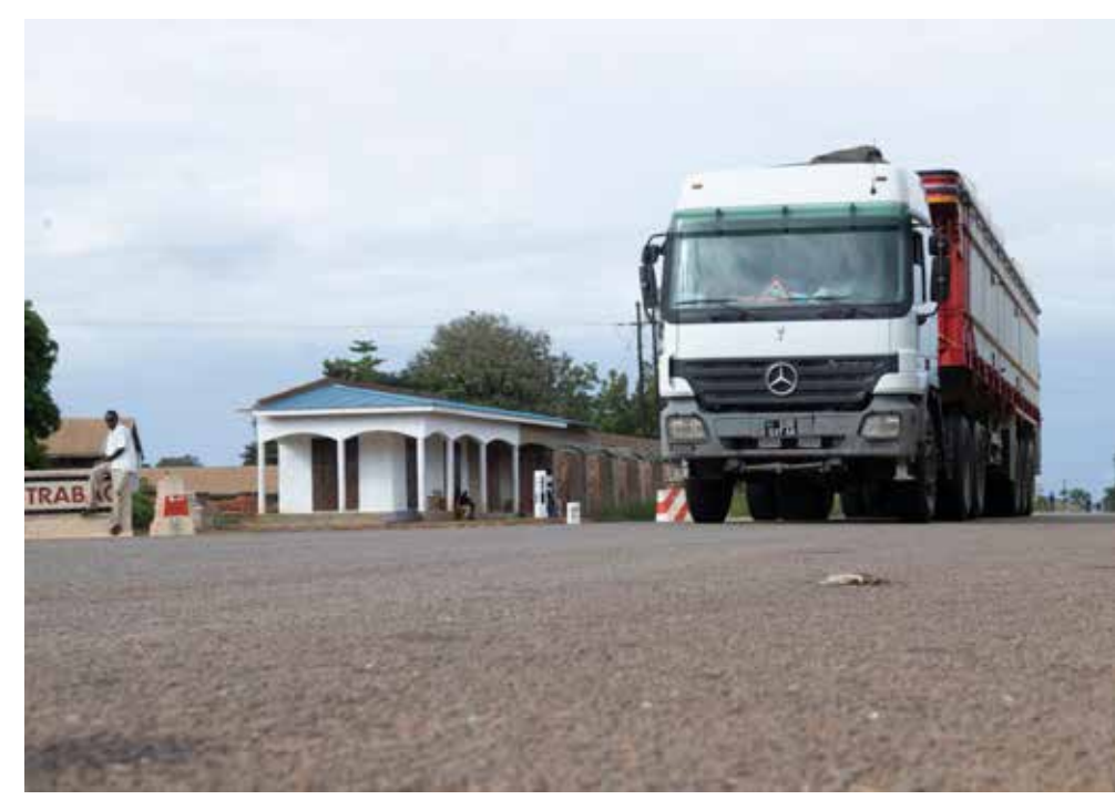
The improved road has eased transportation of goods and services in the region and across borders.

The Atiak-Laropi road has significantly eased transportation for vehicles of all sizes. Abubaker emphasizes the reduction in the cost of servicing vehicles, previously burdened by the road's potholes. Beatrice Apia, a trader in Adjumani, echoes the