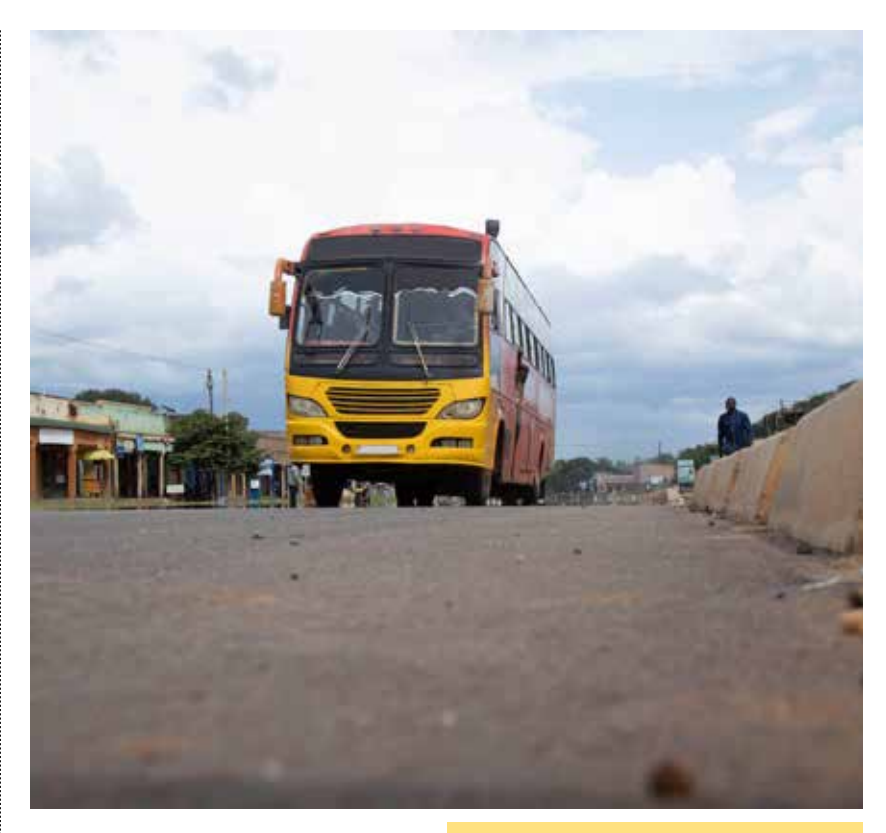
Road infrastructure development is one of the key investment projects that DINU has implemented to stir economic development in Northern Uganda.

Result 3.1: Capacities of Local governments to manage core public financial processes is strengthened to improve service delivery and local development;