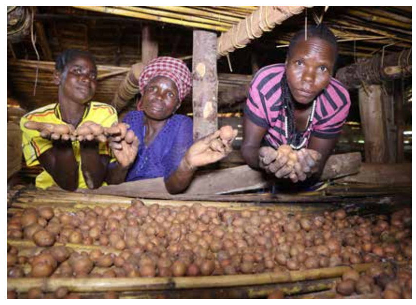
\label{lem:continuous} \textbf{Farmers are now knowledgeable on how to preserve Irish potatoe seeds for seasons ahead.}

Farmers in Zombo District, having undergone rigorous training in advanced agricultural practices by CARITAS and partners the DINU, embraced mass production of potatoes. The shift toward large-scale cultivation paved the way for a unique venture - the production and sale of potato crisps. By adding value to their produce, these farmers demonstrated how strategic interventions can significantly increase income.