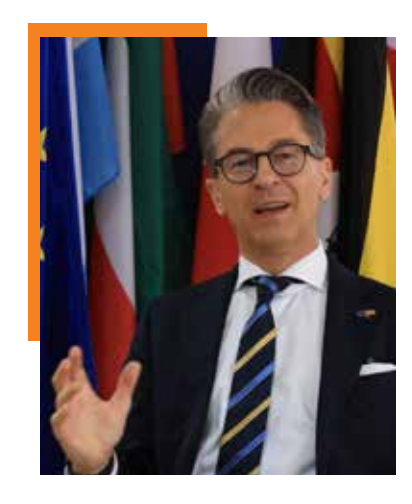
Ambassador Jan Sadek, Head of the European Union Delegation to Uganda.

DINU with its total of Euros150 million funding has been a flagship programme for the European Union. Now that the DINU programme is approaching its end, I am really happy to see all the achievements made and lives improved across Northern Uganda. For example, the construction and rehabilitation of roads to help remote communities gain access to key services; lives of