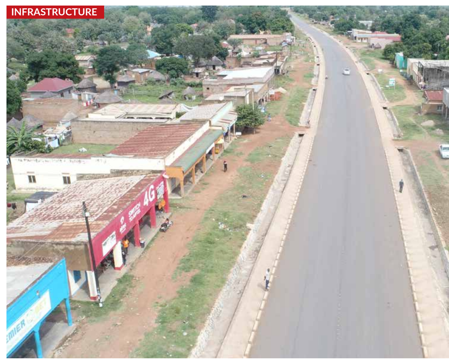
DINU aimed to increase trade of commodities within the region, within the country and with neighbouring countries through the improvement of transport infrastructure.