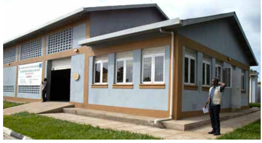
Bulking centres are equipped with modern produce storage equipment. These centres were constructed under DINU Programme to support farmers store their produce and earn better prices.

"With the capacity built, we are able to store our produce the right