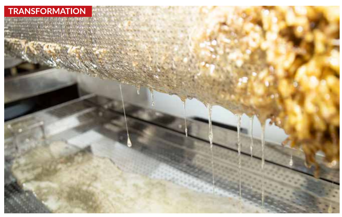
As a result of the DINU training, bee keepers in Amudat are earning better income after processing honey.