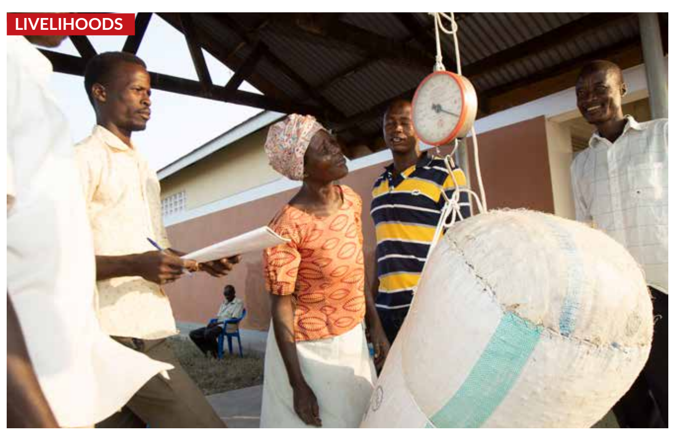
Many farmers are now weighing in and storing their produce for better prices.