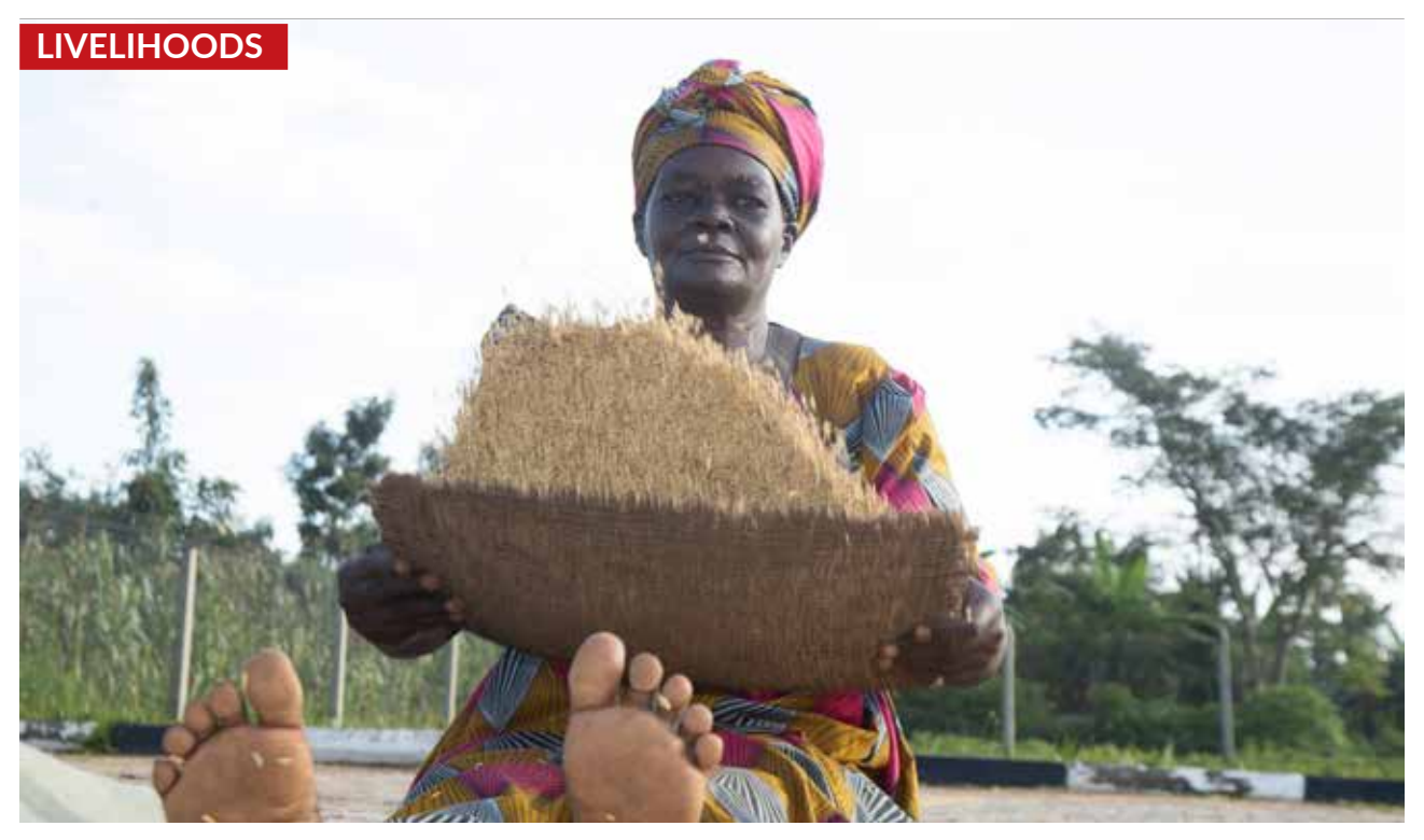
DINU has trained farmers in better post-harvest handling practices for improved quality produce.