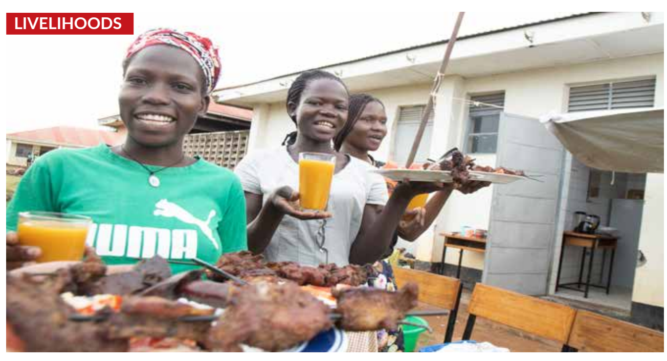
Some of the DINU trained youths are now adding value to their piggery and poultry enterprises to attract better prices.