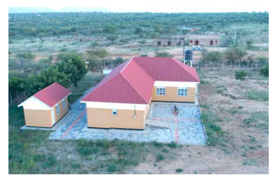
The honey processing centre has enabled bee farmers in Amudat to process honey and its by-products.

However, with support from DINU, a honey processing centre was established and equipped with a processing unit at Amudat District headquarters. DINU supplied the centre with a honey processing unit