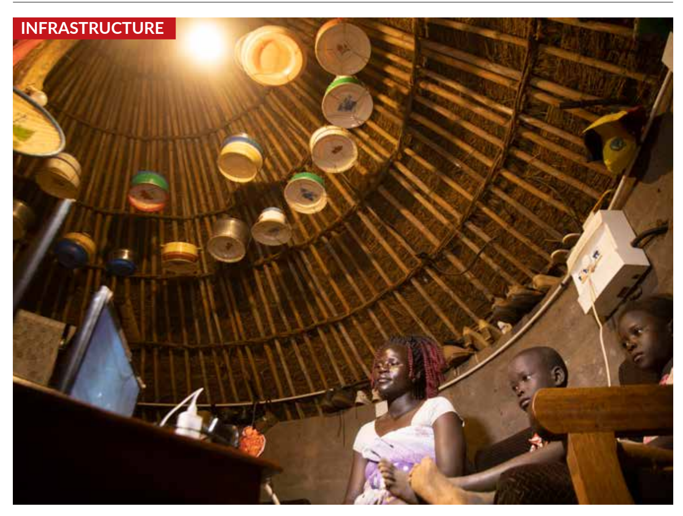
Twenty five villages in Lamwo District benefited from DINU programme funded solar mini grids that have powered the rural areas. The supply of solar power has sparked a boom in businesses like metal fabrication, maize and groundnuts milling, beauty salons and night life.