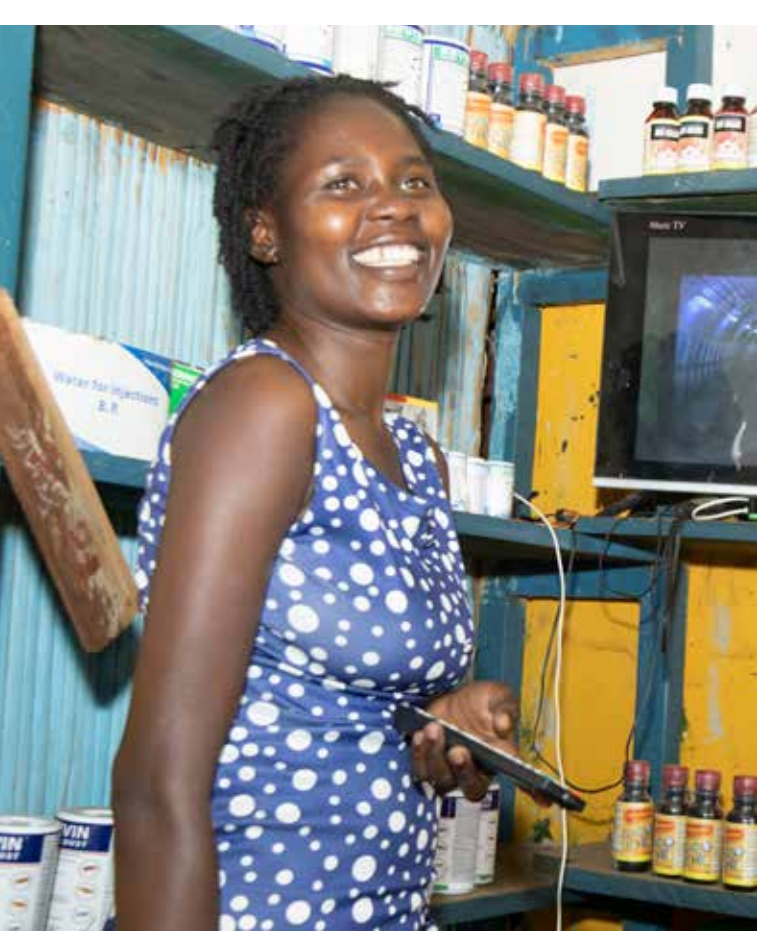
Residents of Paloga are now able to tune into modern gadgets like TV sets for information and entertainment.