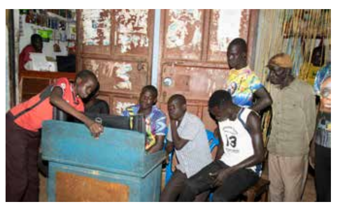
It is now easier to access news, entertainment and sports programming in many centres as a result of the min grids in Lamwo.